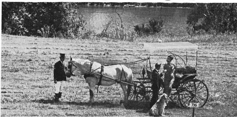
The Group 7 Display Village overlooks this beautiful reach of the Brisbane River at Jindalee

The prices of this latest release range from $3300 to $5800 a block, with the $12,000 minimum building covenant still applying.